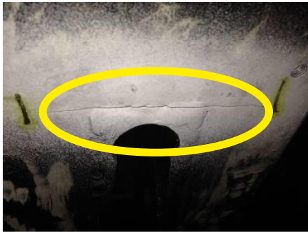
▲ Drive plate area